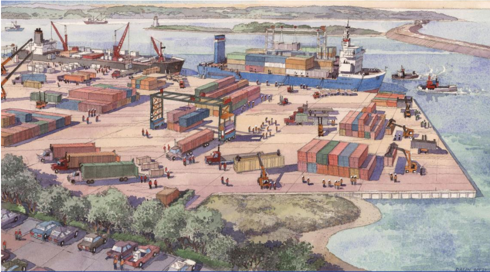
New Bedford Marine Commerce Terminal